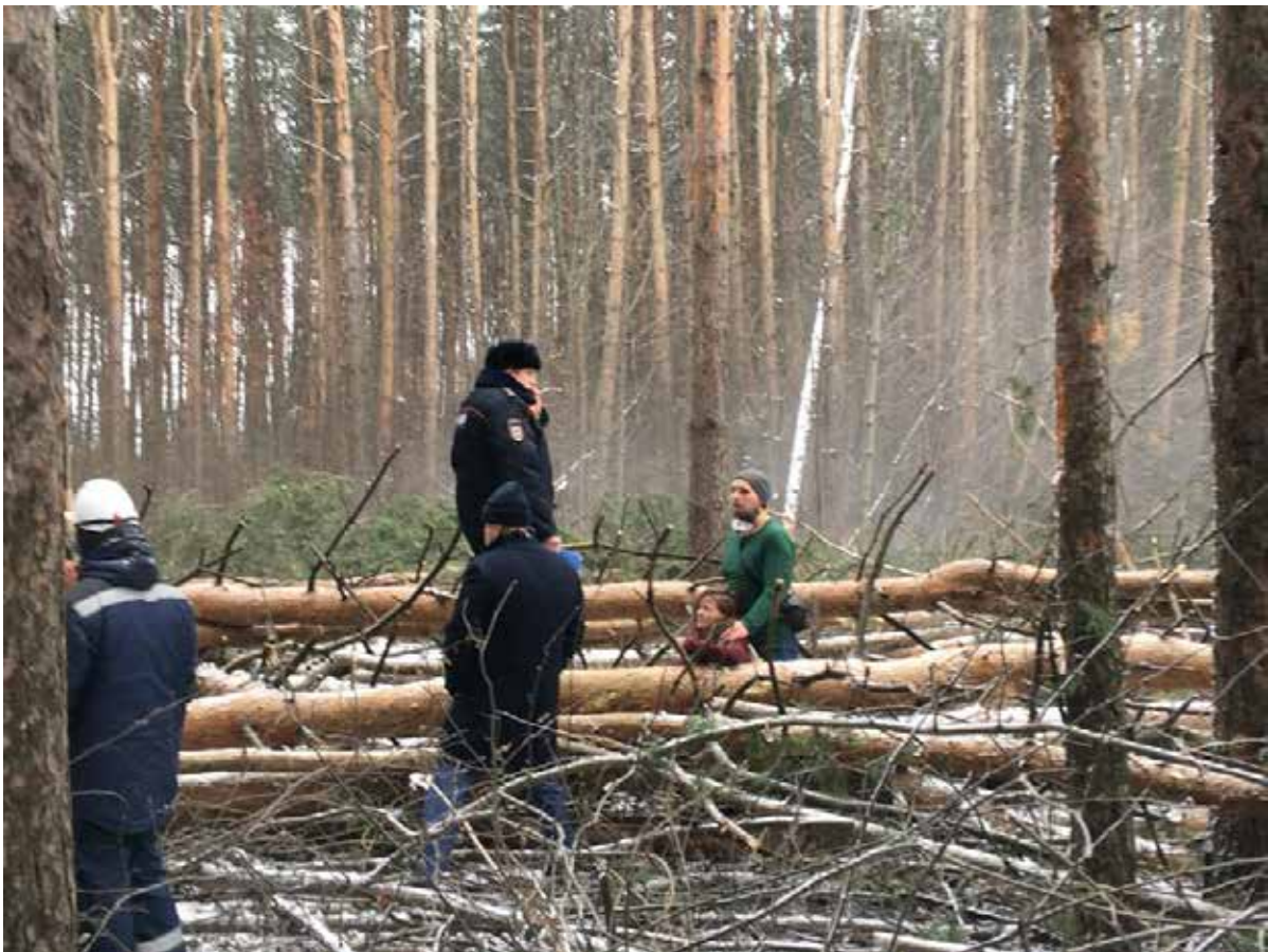
Clashes with the protectors of forests from deforestation for the construction of residential complex, Izhevsk, 12.11.2020.

Unfortunately, this (...) gives carte blanche to law enforcement officials who subscribe to conspiracy theories. After all, honors and promotions are not given to officers for catching polluters of the air and water, but to those who expose unregistered organizations that spread criticisms of the government's environmental policy.