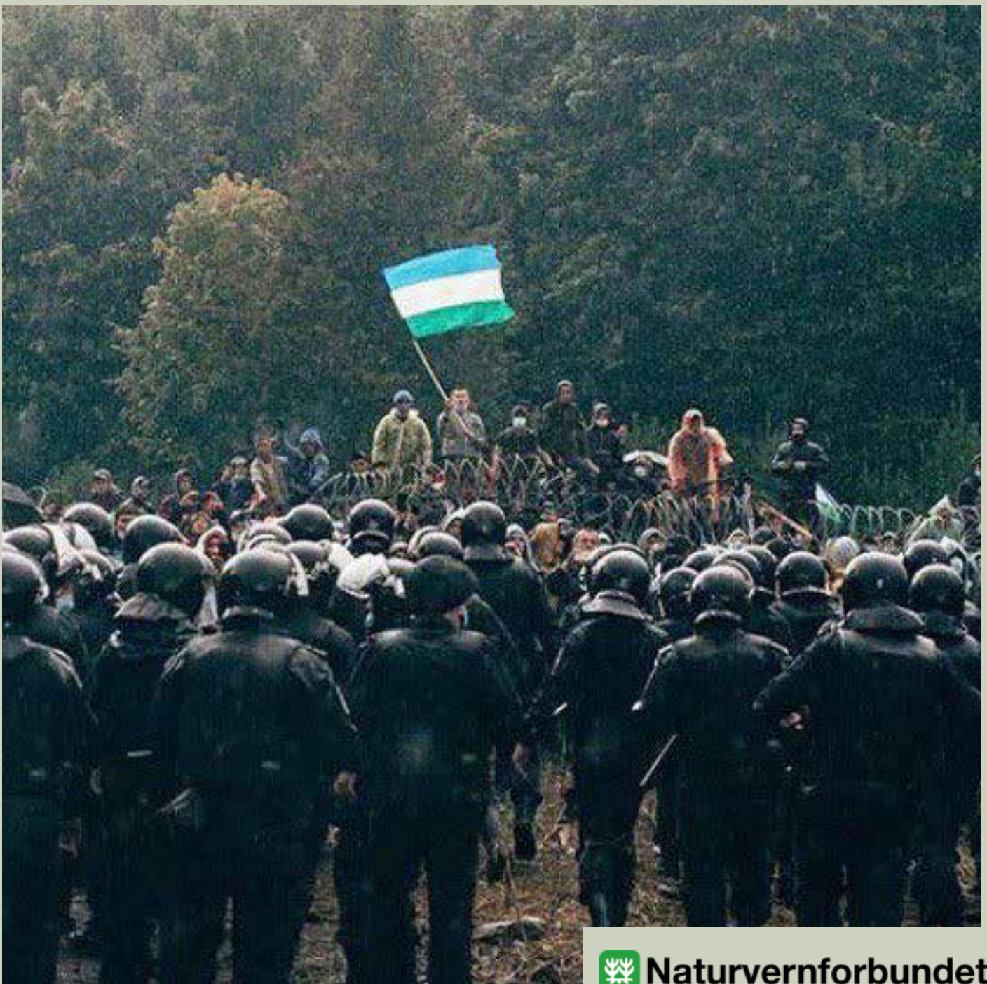
Defending the Kushtau mountain in Bashkortostan, august 2020.

STATUS OF RUSSIA'S FOREIGN AGENT LAWS AND IMPLICATIONS FOR ENVIRONMENTALISTS IN 2020